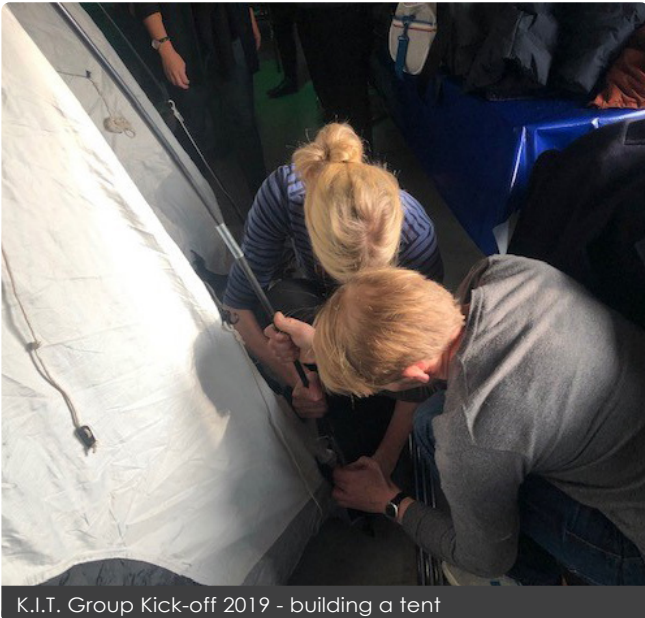
K.I.T. Group Kick-off 2019 - building a tent

Following the ShelterBox activity at the K.I.T. Group Kick-Off (an annual get-together event for all our employees) in January 2019, many employees asked about the possibility of getting involved or donating to this great organization. We were very glad to have the opportunity to hear firsthand from ShelterBox's staff and volunteers about what work in disaster areas can be like.