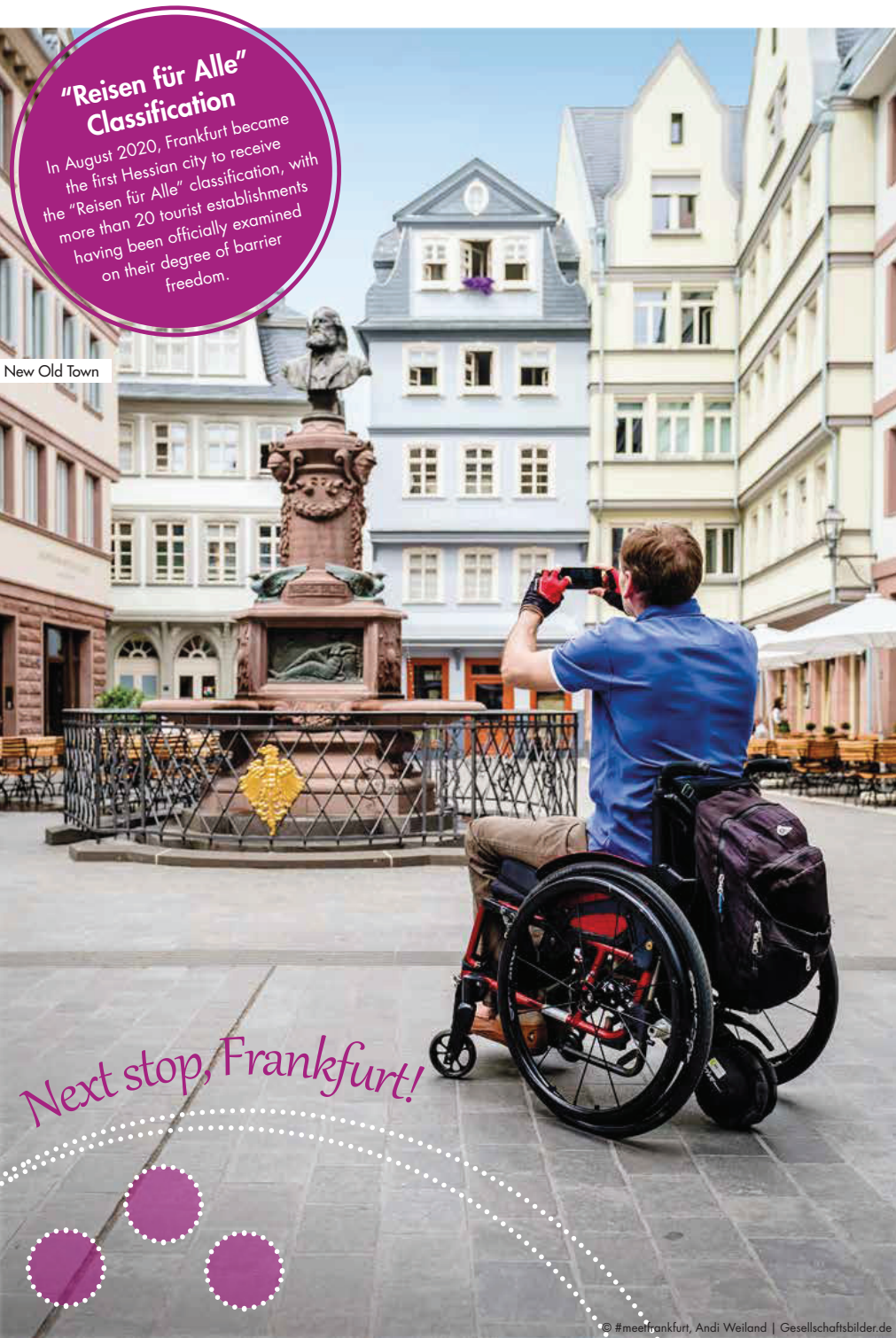
New Old Town